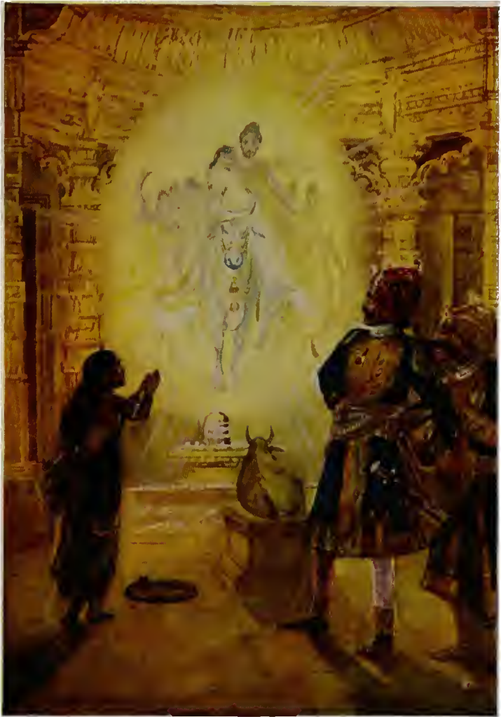
"THE GOD REVEALED HIMSELF TO THE KING AND HIS COMPANIONS IN ALL HIS GLORY AND SPLENDOUR."