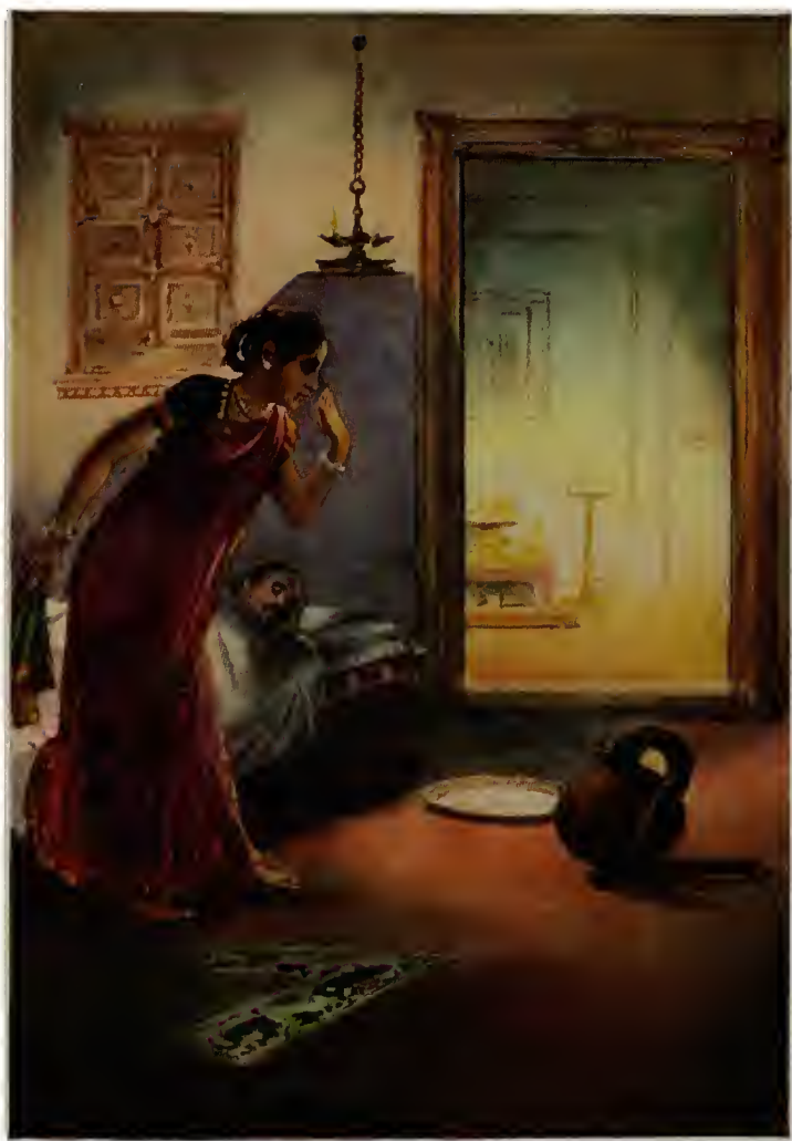
"IT CURLED ITSELF UP INSIDE THE EARTHEN JAR."