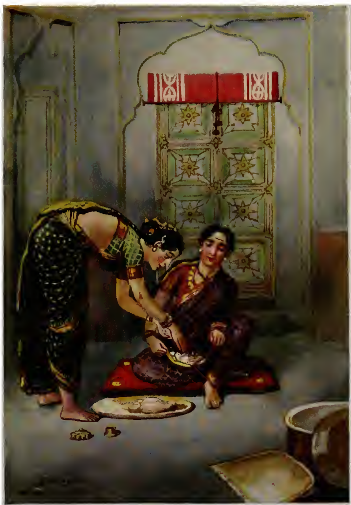
“AND FILL HER LAP WITH WHEAT CAKES AND BITS OF COCOANUT.”