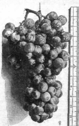
FIG. 2.—Bunch of Muscatel Gordo Blanco grapes.

To save the first crop of raisin grapes from injury is therefore the important problem. As the main injury is done when they are in bud and bloom, that period is the one with which we have to deal. As a result of investigations it was ascertained that if the first bloom could be delayed until the weather became fine the injury would not occur, and that if protected from the cold or from other unfavorable atmospheric conditions the crop could be saved. These facts indicate that it is the tenderness of the plant which renders it subject to injury. To overcome this weak point in the two varieties mentioned, the writer, in the spring of 1893, commenced a series of experiments in crossing these varieties with the Malaga. This California Malaga is a vine of exceedingly thrifty growth and is hardy throughout. Its root system will support the vine in sandy soils, where the Muscat would die. Its leaves are heavy and large, and the work of